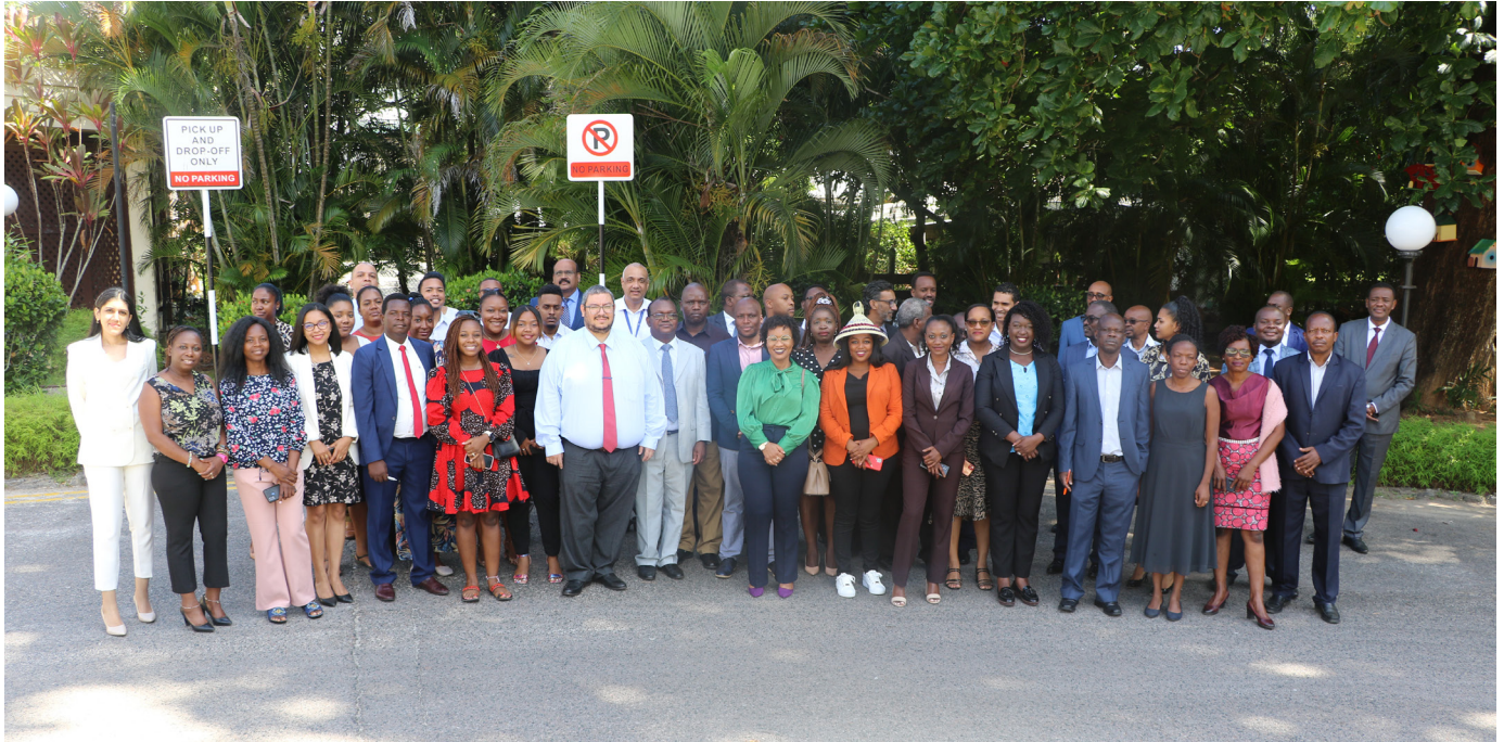
Media, Communication and infrastructure experts at the media training and familiarization workshop in Seychelles

In an initiative aimed at strengthening air travel and ICT connectivity, five regional economic communities and the European Union have enlisted the regional media to raise public awareness on the implementation of two projects. These are Support to the Air Transport Sector Development (SATSD) and the Enhancement of Governance and Enabling Environment in the ICT Sector (EGEE-ICT).