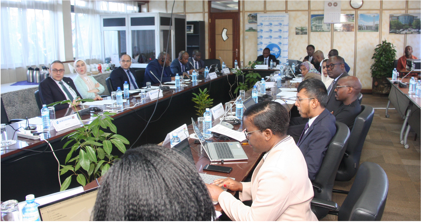
Delegates at the validation workshop on the implication of financial technology on financial stability, Nairobi, Kenya