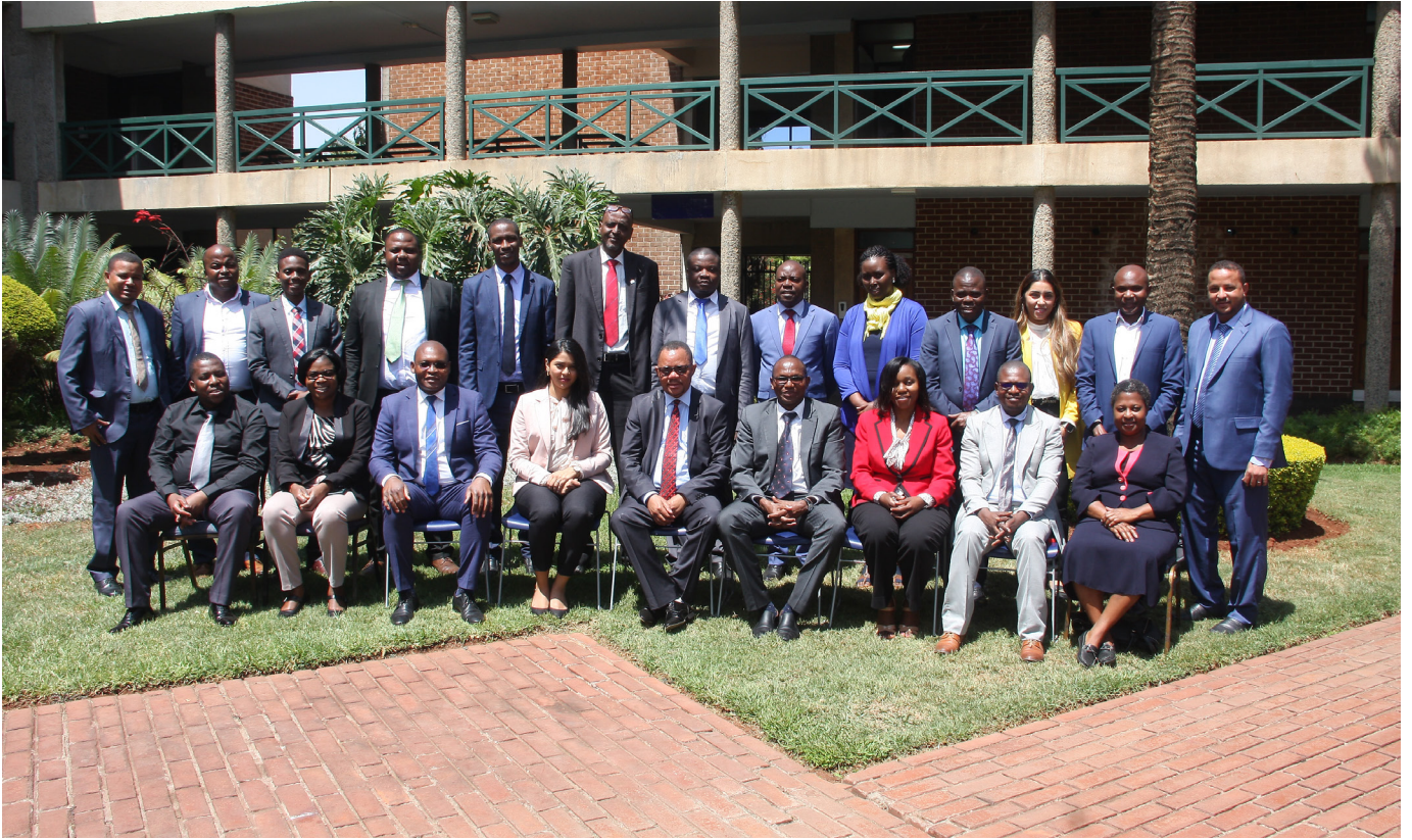
Participants at the workshop