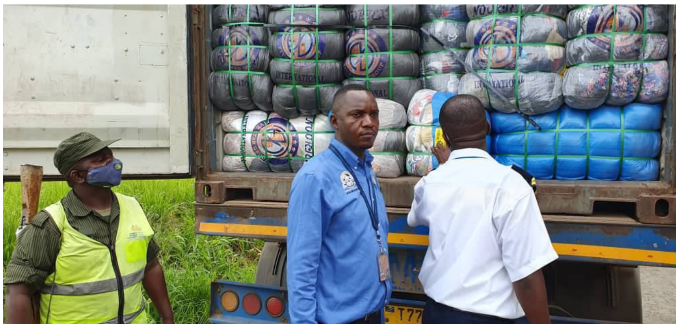
Manual inspection of goods by customs officers

The piloting of the COMESA electronic Certificate of Origin (eCo) is anticipated to commence in 2023. This is expected to go a long way in addressing the administrative inefficiencies in managing paper Certificates of Origin which will soon be replaced by a digital one.